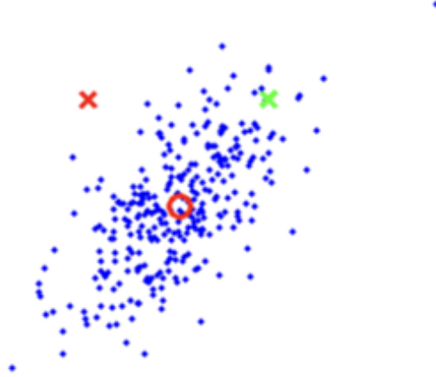
Figure 1: Which of the points marked in x is closer to the cluster centroid? in what sense?

Proof. Pick y \in \mathbb{R}^m , and let z_i = x_i - \bar{x} . Then y^T C y = \frac{1}{n} \sum_{i=1}^n (z_i^T y)^T (z_i^T y) \geq 0 , so C is positive semi-definite. Since x_1, \dots, x_n span \mathbb{R}^d , so do z_1, \dots, z_n . If y is nonzero, then y^T C y = 0 implies that z_i^T y = 0 for all i , which is a contradiction, as there is a linear combination y = \sum_i a_i z_i , so y^T y = \sum_i a_i y^T z_i = 0 . \square